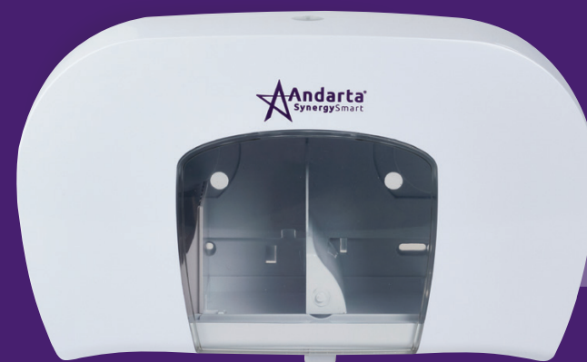
System 600 Twin Toilet Roll Dispenser