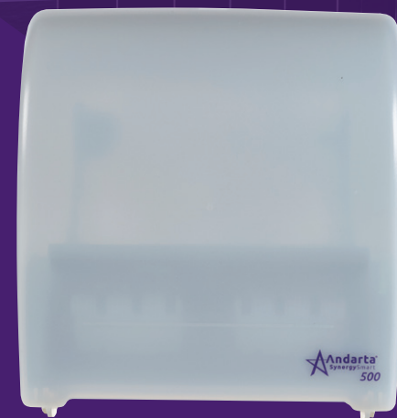
System 500 Autocut Hand Roll Towel Dispenser