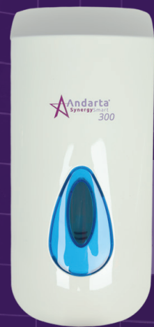
System 300 Handwash/ Sanitiser Dispenser

Designed to withstand the demands of any washroom, our SynergySmart range helps keep your washroom looking good and, more importantly, clean. Combining cost-in-use efficiencies with innovative ways to make dispensing safer, cleaner and easier, these are dispensers that will truly meet your every requirement.