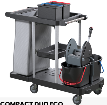
COMPACT DUO ECO 72-213