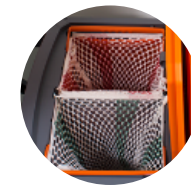
INTEGRATED WASTE UNIT

Please note, some components shown are additional accessories - see page 8 for full component list for each trolley.