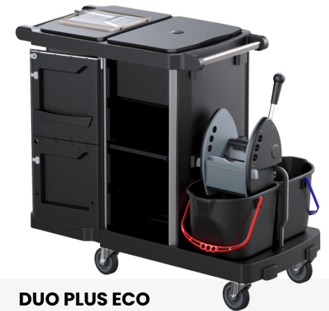
DUO PLUS ECO 72-309