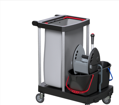
DUO ECO 72-312