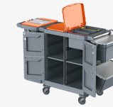
IPC 140 PLUS