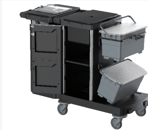
IPC 100 ECO 72-440

Manufactured in line with ISO:10021:2016 standards and made with over 90% recycled plastic, our zero-impact ECO range reflects our commitment to environmental sustainability.