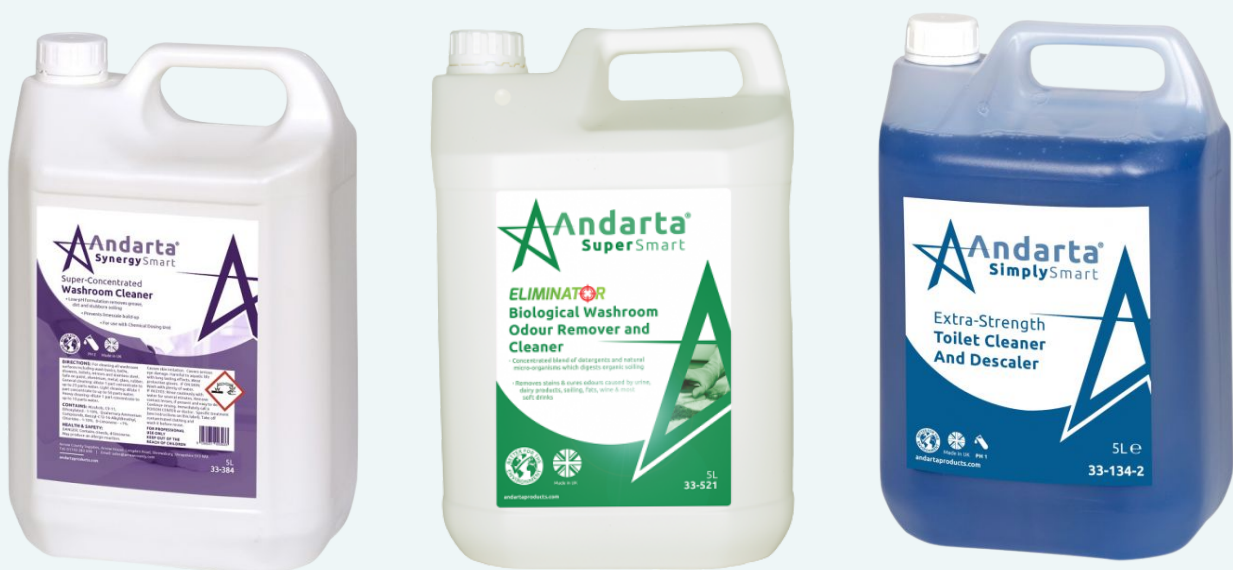
From L-R: Andarta Ecological Super Concentrated Washroom Cleaner ; Andarta Eliminator Biological Washroom Odour Remover & Cleaner; Andarta Extra Strength Toilet Cleaner & Descaler